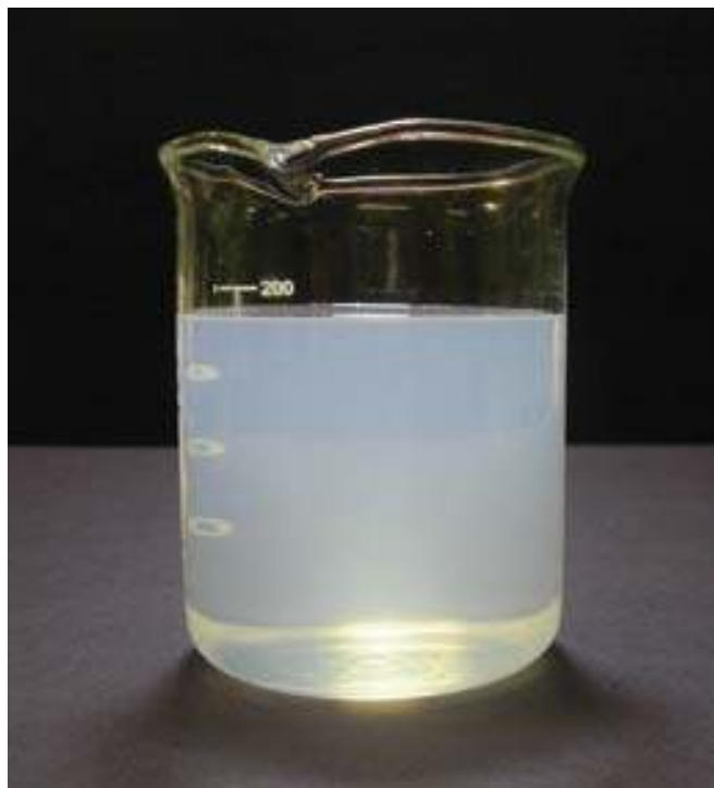
1% Magnasoft JSS hydrophilic textile enhancer water solution after boiling at 100°C, pH:12

(a) Biocides must be used in accordance with FIFRA regulations and manufacturer's label directions.