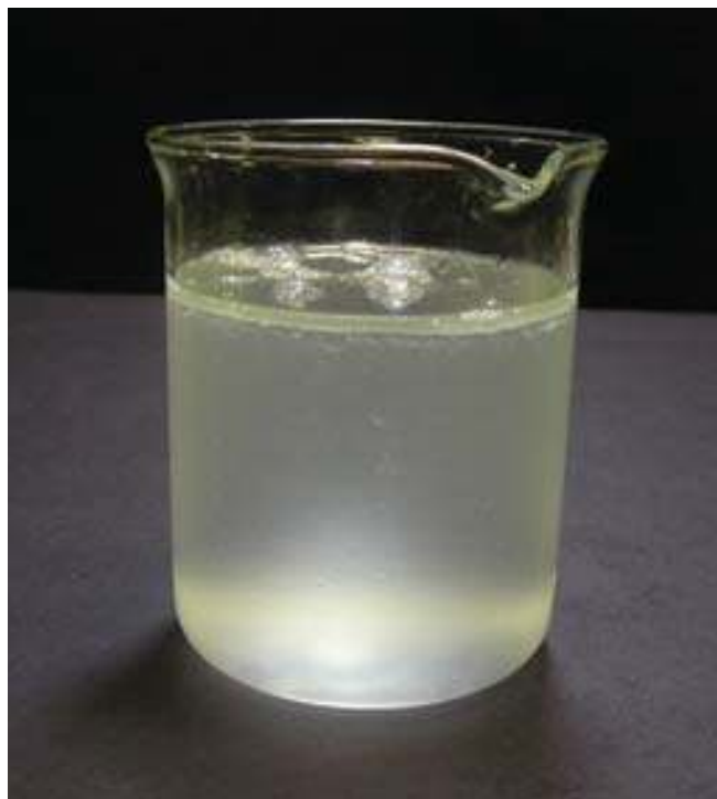
1% Conventional aminosilicone emulsion after boiling at 100°C, pH:12.