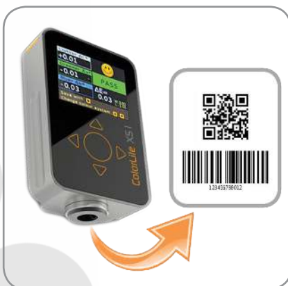
Integrated QR- and BAR-Code scanner for sample ID and name

The small sized instrument, made in Germany from a solid aluminium block, weighs just 270g. It is equipped with the latest high-definition technology allowing a high resolution spectral scan in 3.5nm steps in less than 1 second. The brilliant colour high contrast O-LED display makes a perfect user interface. The menu is simple and clear, so anyone can perform measurements fast and accurate. A further unique feature of the ColorLite XS1 is the integrated data-matrix and bar-code camera. This allows for fast effect sample identification and management.